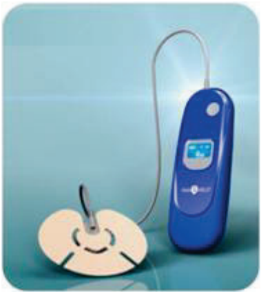
Picture of PainShield with Patch

In other countries outside the United States where the product is approved for such use, PainShield is used to treat tendon disease and trigeminal neuralgia (a chronic pain condition that affects the trigeminal or 5th cranial nerve, one of the most widely distributed nerves in the head); previously, the therapeutic options for these disorders have been very limited. In the United States, PainShield is only cleared to treat pain, muscle spasms, and joint contractures associated with or caused by various conditions or diseases. It has also been used to treat pelvic and abdominal pain. To date, to the best of our knowledge, the primary treatment options for several of these conditions are pain medication and surgery. Several additional causes of pain, and the treatment of that pain with the PainShield product, can be explored through clinical trials.