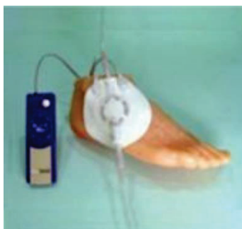
Picture of WoundShield Driver and Instillation Patch

In March 2020, we signed a license agreement with Sanuwave Health, Inc. (“Sanuwave”) for the manufacture and delivery of our WoundShield technology. Under the terms of the agreement, NanoVibronix received warrants to purchase up to 127,000 of Sanuwave stock upon signing and, will receive a $250,000 milestone payment based on FDA approval, and 10% royalty on Sanuwave’s gross revenues from sales or rentals of WoundShield. In return, Sanuwave has received the worldwide, exclusive rights to the Company’s WoundShield product and technology. We are currently in late stage discussions with Sanuwave to terminate this agreement in exchange for forfeiting our Sanuwave warrants and expect this termination be finalized in the second quarter of 2024.