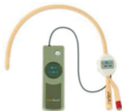
Picture of UroShield with actuator

UroShield is intended to prevent bacterial colonization and biofilm formation, increase antibiotic efficacy in the catheter lumen and decrease pain and discomfort associated with urinary catheter use. It is designed to be used with any type of indwelling urinary catheter regardless of the material or coating. Use of the device is contraindicated for use while there is an active Urinary Tract Infection. We believe that UroShield may be the first medical device on the market that attempts to simultaneously address all of the aforementioned catheter-related issues. UroShield is similar in design to PainShield, in that it uses a driver unit that produces low frequency, low intensity ultrasound. The driver unit connects to a disposable transducer that is clipped onto the external portion of the catheter to deliver ultrasound therapy to all catheter surfaces as well as the tissue surrounding the catheter.