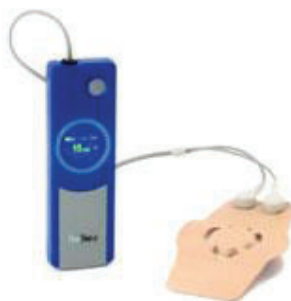
Picture of PainShield with Patch