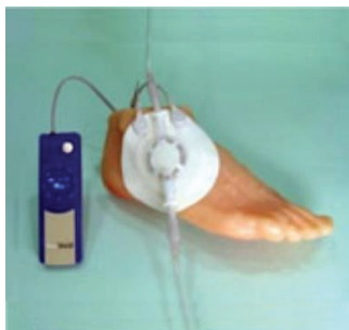
Picture of WoundShield Driver and Instillation Patch

WoundShield delivers surface acoustic waves to the location of the wound. Surface acoustic waves move laterally across the surface of the wound, which enables the transfer of the acoustic energy of the waves along the entire wound surface in a continuous and consistent mode, providing access to the waves’ benefits for a longer treatment period than conventional ultrasound without the need for supervision or a treatment session by a clinician.