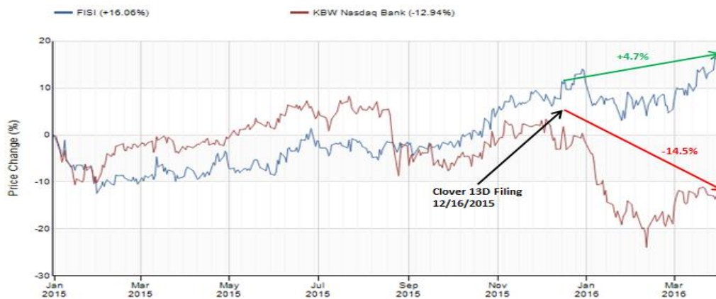
Financial Institutions, Inc. - Price Change (%)