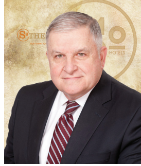
Gen. Anthony C. Zinni (USMC Retired) Director