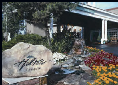
Hilton Santa Fe Santa Fe, New Mexico