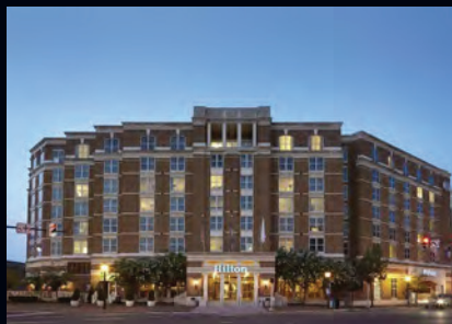
Hilton Alexandria Old Town Alexandria, Virginia