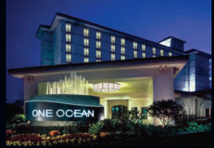
One Ocean Atlantic Beach, Florida