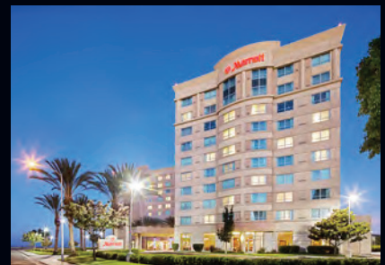
Fremont Marriott Silicon Valley Fremont, California