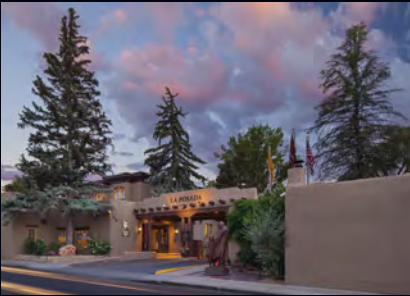
La Posada de Santa Fe Santa Fe, New Mexico