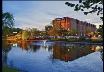
Hilton Parsippany Parsippany, New Jersey