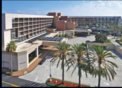
Hilton Costa Mesa Costa Mesa, California