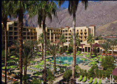
Renaissance Palm Springs Palm Springs, California