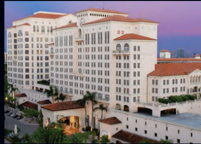
Hyatt Regency Coral Gables Coral Gables, Florida