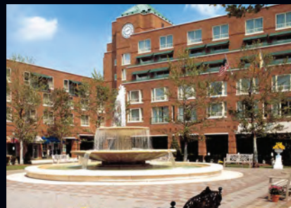
Westin Princeton Princeton, New Jersey