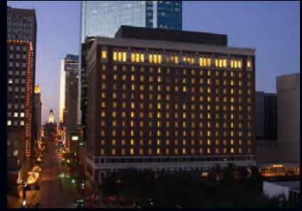
Hilton Fort Worth Fort Worth, Texas