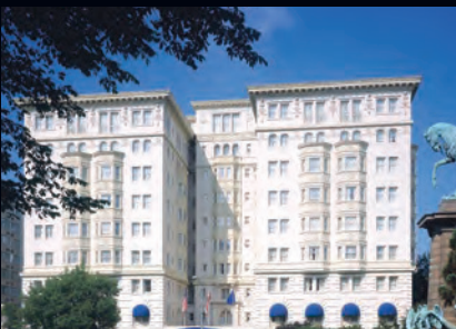
The Churchill Washington, District of Columbia