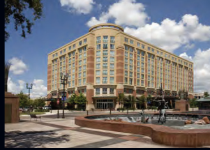
Marriott Sugar Land Houston, Texas