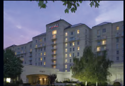
Hyatt Regency Long Island Hauppauge, New York