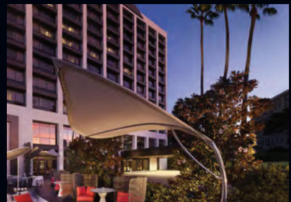
Marriott Beverly Hills Beverly Hills, California