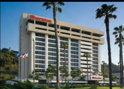
Sheraton San Diego Mission Valley San Diego, California