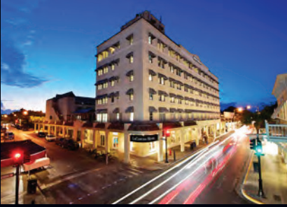
La Concha Key West Key West, Florida