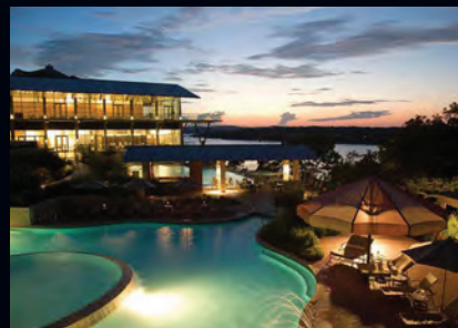
Lakeway Resort and Spa Austin, Texas