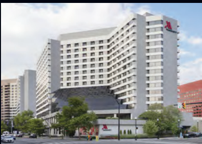
Marriott Gateway Crystal City Arlington, Virginia