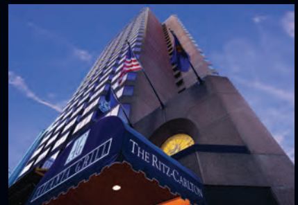
Ritz-Carlton Atlanta Atlanta, Georgia