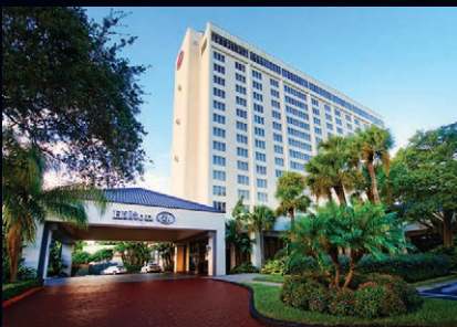
Hilton St. Petersburg St. Petersburg, Florida