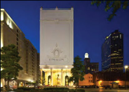
Le Pavillon New Orleans, Louisiana