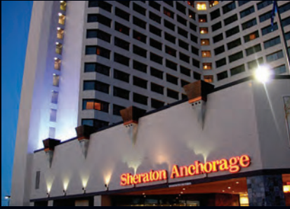
Sheraton Anchorage Anchorage, Alaska