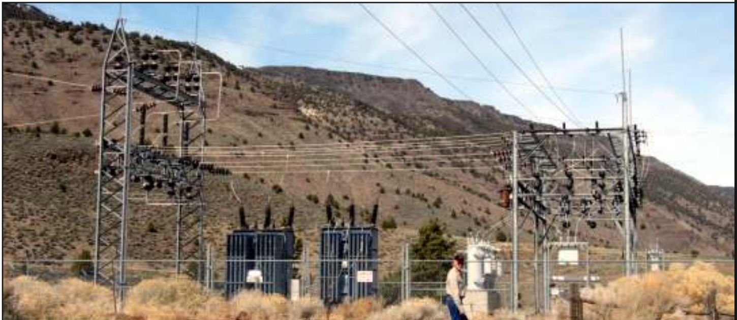
Surprise Valley Electrification Corporation substation is located immediately south of NGP's Crump Geyser leases.