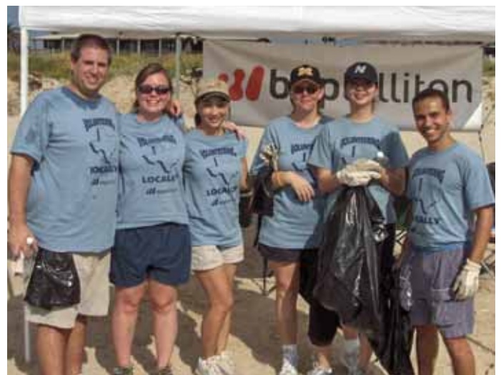
BHP Billiton employees regularly volunteer in beneficial community activities throughout the year, such as an annual clean up of beaches on the Gulf Coast, as pictured above.

In the Gulf of Mexico, BHP Billiton is one of the few operators of oil and gas production facilities to earn ISO 14001 certification, which was renewed in May 2006. Also in May 2006, the company was re-certified for OHSAS (Occupational Health Safety and Standard) 18001 certification, which recognizes that the company has implemented policies and procedures to help minimize health and safety risks to employees and other persons.