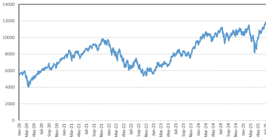
Historical Performance of the NDXT

The historical levels of the NDXT should not be taken as an indication of future performance, and no assurance can be given as to the closing level of the NDXT on any coupon observation date, including the determination date.