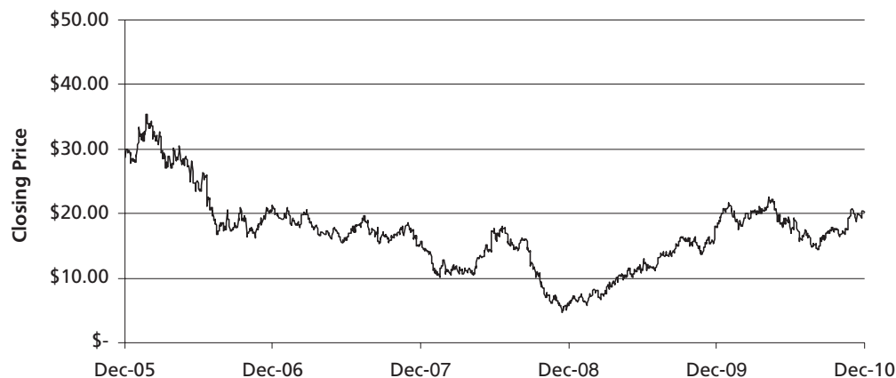
Historical Performance of the Common Stock of Marvell Technology Group Ltd.

The graph below illustrates the performance of Marvell Technology Group Ltd.'s common stock from December 7, 2005 through December 7, 2010, based on information from Bloomberg, and we have not participated in the preparation of, or verified, such information. Past performance of the Underlying Stock is not indicative of the future performance of the Underlying Stock.