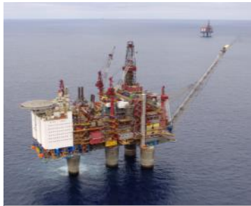
Gullfaks Operated since 1978