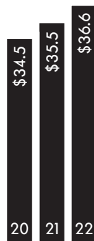
Organic Sales* ($ in billions)