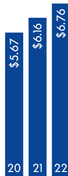
Cash Dividends Declared (per Common share)