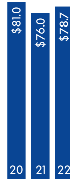
Backlog ($ in billions)