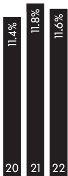
Segment Operating Margin Rate*