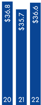
Sales ($ in billions)

Northrop Grumman is a leading global aerospace and defense technology company. Our pioneering solutions equip our customers with the capabilities they need to connect and protect the world, and push the boundaries of human exploration across the universe. Driven by a shared purpose to solve our customers' toughest problems, our more than 95,000 employees define possible every day.