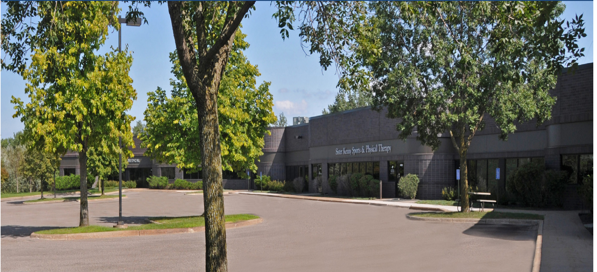
Shoreview Business Center, Shoreview, MN. Medical Office Building. Major tenant: Allina Medical Clinic. Square Feet: 49,809.