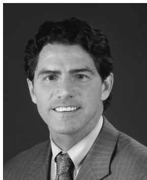
Executive Vice President and President of El Paso Exploration & Production Company