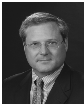
Executive Vice President and Chief Financial Officer