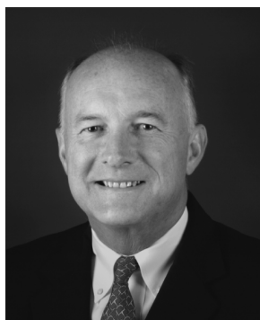
Executive Vice President, Pipeline Group