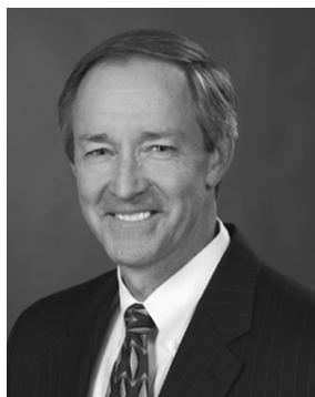
Executive Vice President and General Counsel