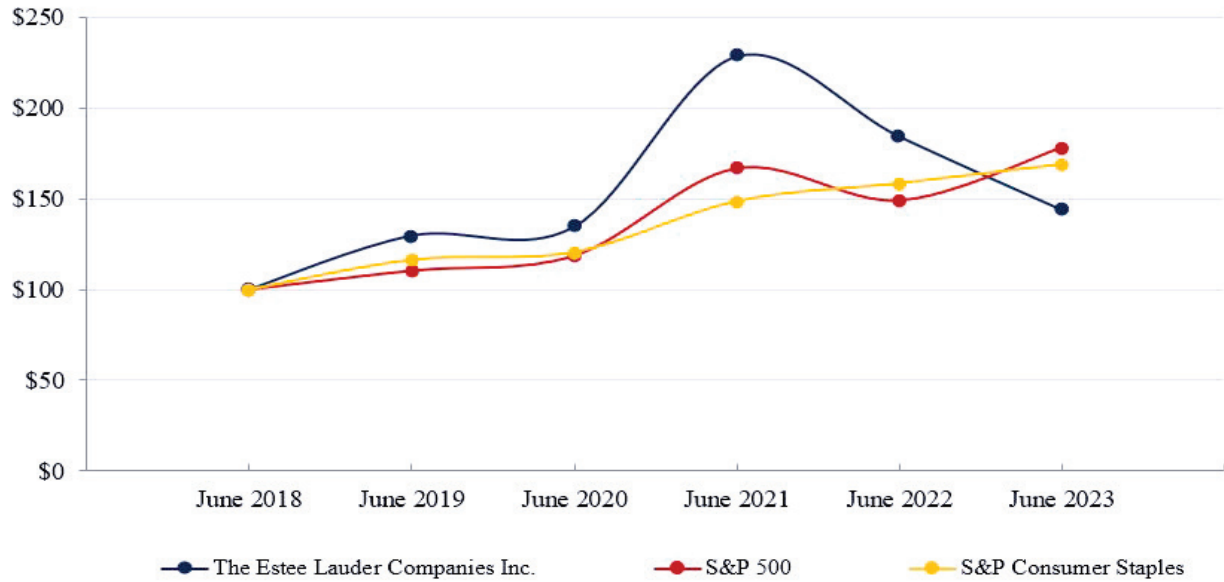
Cumulative five-year total stockholder return

The following graph compares the cumulative five-year total stockholder return (stock price appreciation plus dividends) on the Company's Class A Common Stock with the cumulative total return of the S&P 500 Index and the S&P Consumer Staples Index. The returns are calculated by assuming an investment of $100 in the Class A Common Stock and in each index on June 30, 2018.