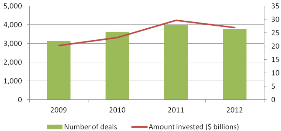
Venture Capital Investments and Number of Deals, 2009-2012

Some startups, however, may struggle to attract funding from VCs because VCs tend to invest in startups with certain characteristics. A defining feature of VCs is that they tend to focus exclusively on startup companies with high-growth potential and a high likelihood of going public after a few years of financing. VCs also tend to invest in companies that have already used some other sources of financing, tend to be concentrated in certain geographic regions ( e.g. , California and Massachusetts) and often require their investments to have an attractive business plan, meet certain growth benchmarks or fill a specific portfolio or industry niche. 857 In addition, when investing in companies, VCs tend to acquire significant control rights ( e.g. , board seats, rights of first refusal, etc.), which they gradually relinquish as the company approaches an initial public offering. 858