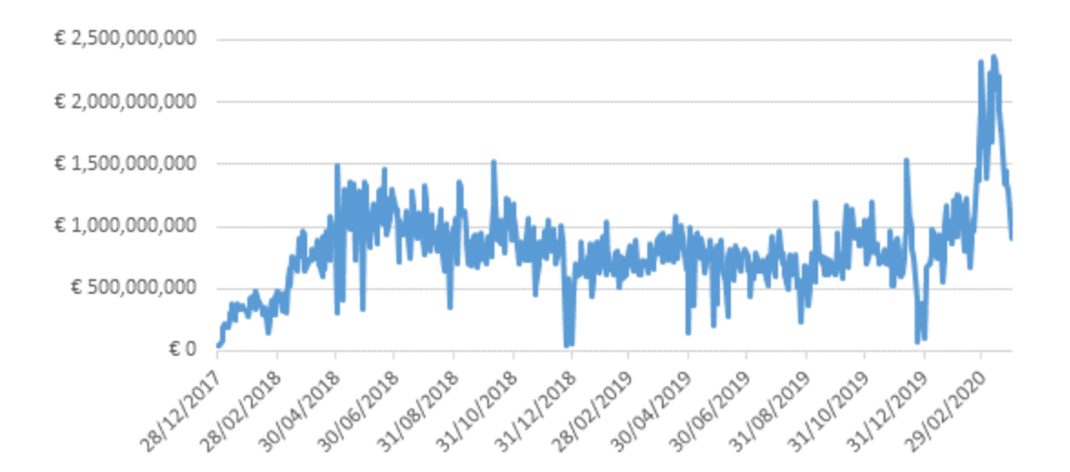
Chart A: Average Daily Value Traded in Choe Europe Periodic Auctions

actually exceeding this threshold, reflecting the value that this offering has provided to market participants that trade European equities.