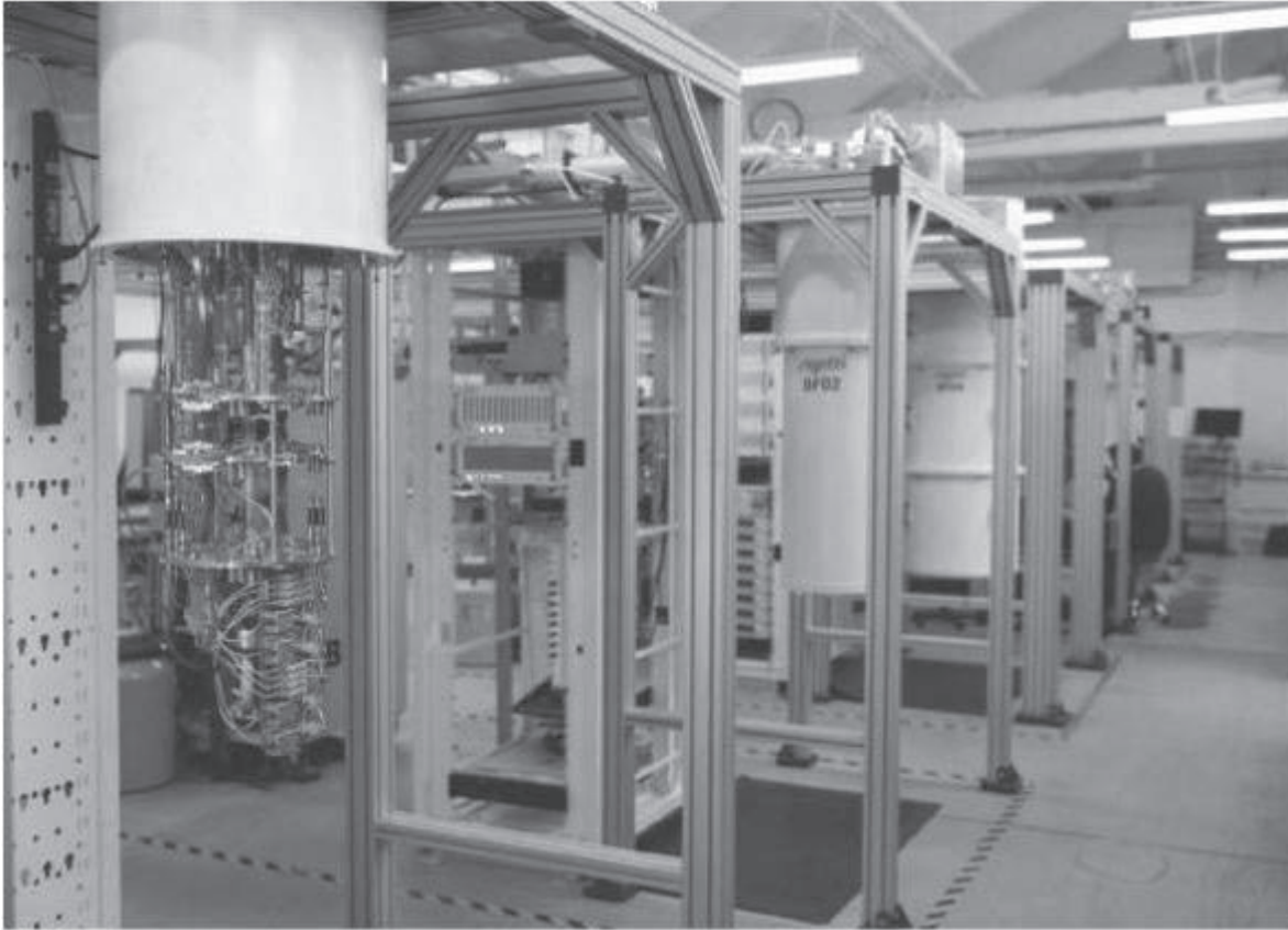
Rigetti's quantum computing facility in Berkeley, California includes both research and development and production quantum processing units, which are each housed in a cryogenic refrigerator.