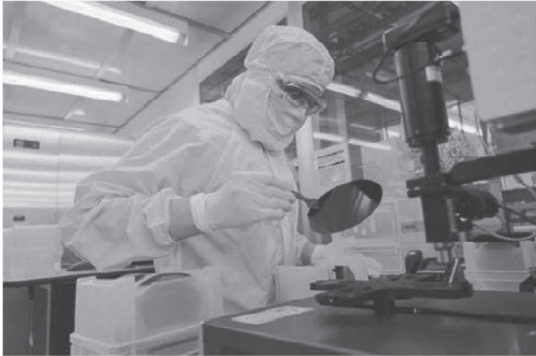
A Rigetti employee inspects a silicon wafer with superconducting quantum integrated circuits that was fabricated at Rigetti's Fab-1 facility.