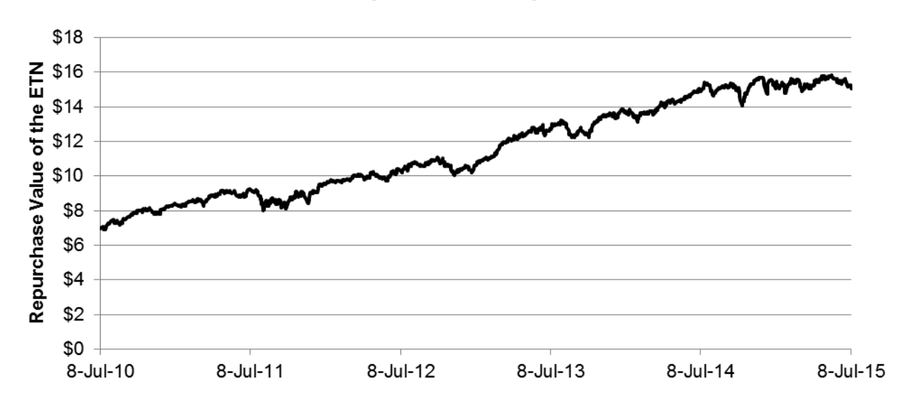
Historical Performance of the ELEMENTS<sup>SM</sup> - "Dogs of the Dow" from July 8, 2010 to July 8, 2015

The Securities are linked to the performance of the Dow Jones High Yield Select 10 Total Return Index SM. Publication of the Dow Jones High Yield Select 10 Total Return Index SM began on August 27, 2007. No actual investment in securities linked to the Dow Jones High Yield Select 10 Total Return Index SM was possible prior to August 27, 2007. The following graph sets out the historical performance of the Securities from July 8, 2010 to July 8, 2015. The historical performance of the Securities shown below reflect the daily repurchase values of the Securities calculated on each trading day from July 8, 2010 to July 8, 2015 and do not reflect the actual trading prices of the Securities. The graph below does not represent the actual return you should expect to receive on the Securities. Historical performance of the Securities is not indicative of future performance of your investment in the Securities. The Securities do not guarantee any return of, or on, your initial investment. Any payment at maturity or upon earlier repurchase is subject to our ability to satisfy our obligations as they become due.